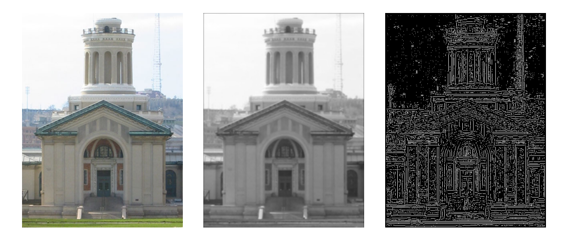
Figure 5: Hammerschlag Hall: original image (left), blurred with the mask (middle), and after running edge detection (right). See text for mask values.