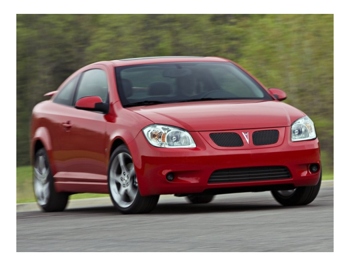
Figure 6: Manipulate me!

If you choose to do this task, be creative! Submissions will be displayed on the Autolab scoreboard and we will make an effort to highlight exemplary submissions. If you include a (small!) file manipulate.png, we'll run your transformation against that image; otherwise we'll run your transformation on g5.png.