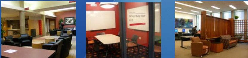
Fig 1. Pictures used to generate ideas for department needs