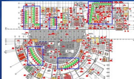
Fig 2. Options looked at for placement of rooms